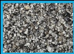
SILVER ASH BLACK