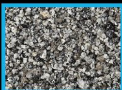
SILVER ASH BLACK